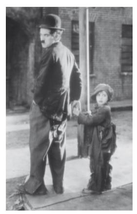
The Kid, 1921. Charles Chaplin

Exhibition Museo Centro Gaiás | 3rd floor 22 July, 2020 - 10 January, 2021