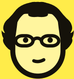
JESÚS CIMARRO FESTIVAL INTERNACIONAL DE TEATRO DE MÉRIDA