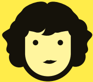
HORTENSE ARCHAMBAULT FESTIVAL D'AVIGNON